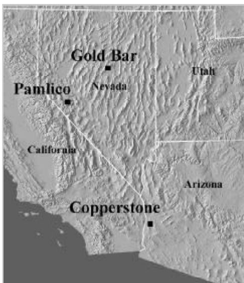
Figure 4. Pamlico

The drilling program that commenced November 14, 2002 will focus on two areas, the Central Mine Area and the Northwest end of the Main zone. Both of these areas have narrow high-grade veins and it is reasonable to expect that there will be some similar high grade intersections. The real question concerns the possibility of thicker high-grade intersections that will move this property up the priority list. Optioning this property to American Nevada also frees up about $100,000 of Bonanza's money that had been designated for work on the Pamlico property.